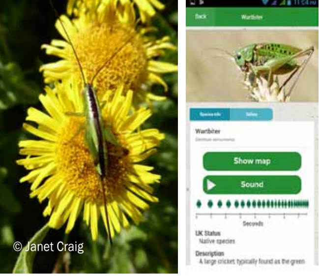
Oak bush cricket with new iRecord app for grasshoppers