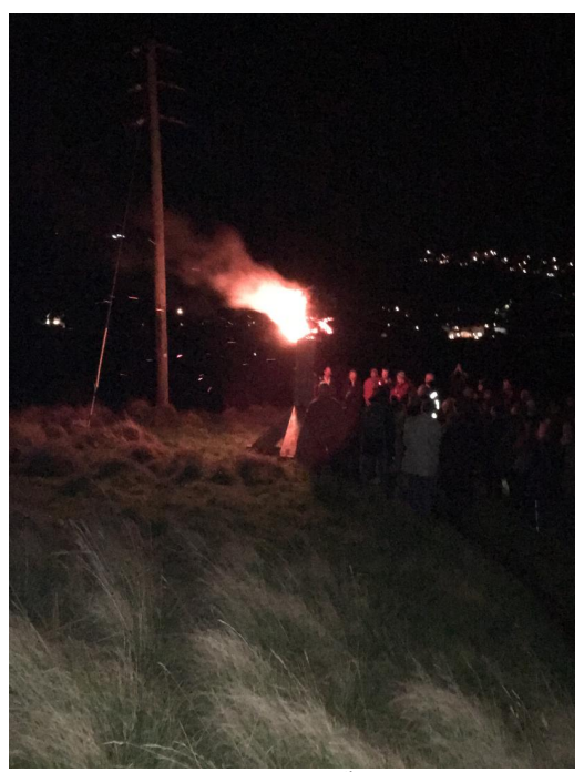
Sutton Poyntz Beacon 11th November 2018