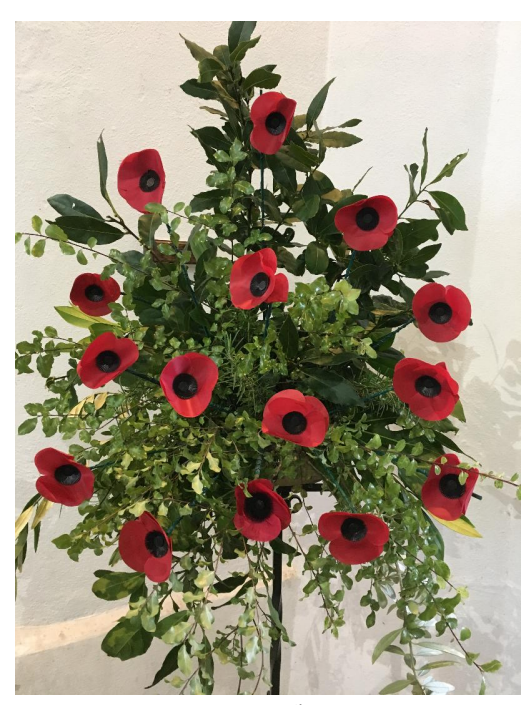
St Andrews Church 11th November 2018.