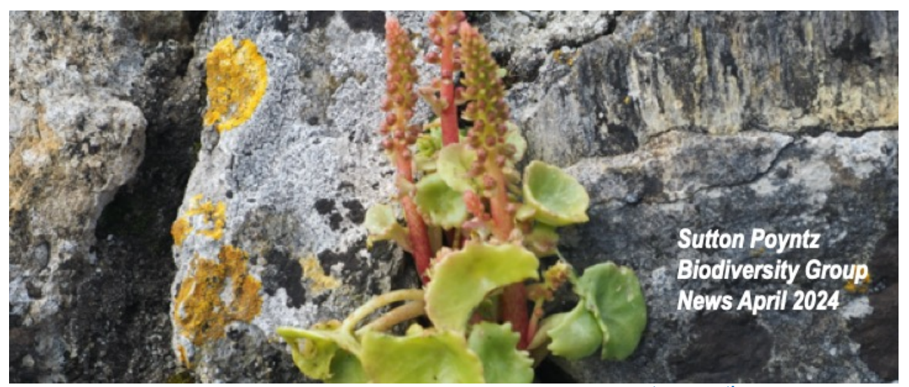
Celebrating fifteen years of Garden Bird Watch 21st to 27th April 2024.

The banner photograph this month is navelwort Umbilicus rupestris just coming into flower. It is really awest country plant seen in most places in a line from the Mersey to the Hamble but also in eastern England in coastal areas. It does really like acidic conditions so those who holiday in the Lake District are certainly likely to see it. However, in Sutton Poyntz, it defies the general and is found on calcareous walls. I have also seen it on the Golden Cap estate on hedge banks of soil. Some of the other plants seen on our walls are ferns such as rustyback Asplenium ceterach and black spleenwort Asplenium adianitum nigrum but both take some looking for.