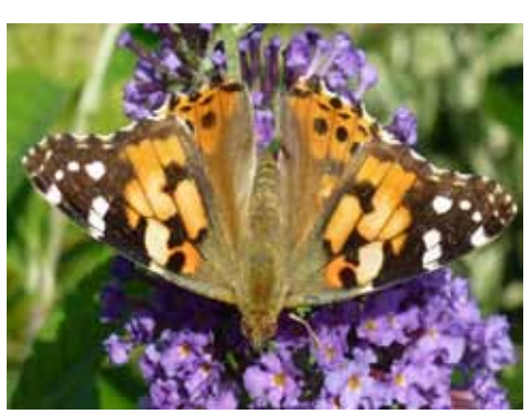
Painted Lady Butterfly

The hot weather from mid-July coupled with the occasional wet period has been ideal for butterflies. Dorothy Emblem reported around 20 Peacock emerging from larvae on a nettle bed in her garden. Janet Craig has been busy photographing butterflies on Buddleia in gardens on Old Bincombe Lane illustrated by the migrant Painted Lady, whch has been seen across Dorset in small numbers. Brimstone, which was scarce in the spring has started to emerge and with luck should over-winter. Watch out for a deep yellow butterfly with black wing markings. This is a migrant Clouded Yellow, which we have seen across Dorset in the second half of August. A small Tortoiseshell favours plants such as Water Mint and Common Fleabane in wet areas. Whites are doing very well in my garden