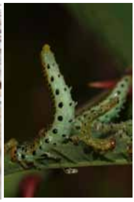
Vapourer moth, eggs, larvae and adult male.