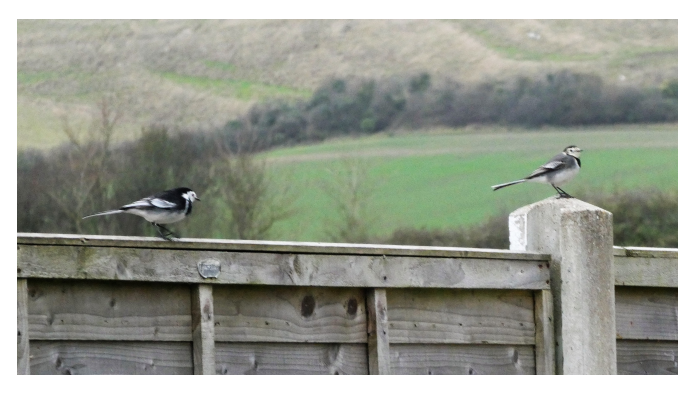
Pied wagtails on garden fence

What is also interesting is birds seen in the wider countryside. Shirley reported a teal on the pond, which Jack considers to have flown in with the mallard from Lodmoor. Ros Evans reports snipe from the water meadows to the east of the village. Puddledock Lane has been a hive of activity with tawny owl around 5.00pm most evenings. On the second week in January there were many blackbirds on the tall trees