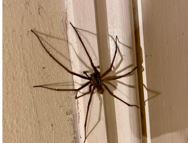
Large house spider Tegenaria gigantea.

The rose is nearest to sweet briar but is fairly certainly a hybrid. There were still a few herbs around on the calcareous grassland last week including slender centaury, harebell, marjoram and small scabious. Really good year for blackberries, hawthorn and rose but not so many sloes.