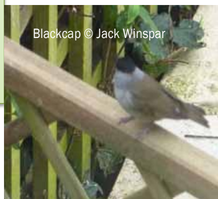
Blackcap