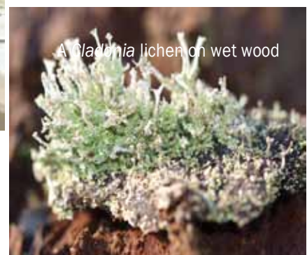
A Nadisia lichen on wet wood