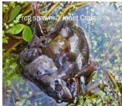
Frog spawn