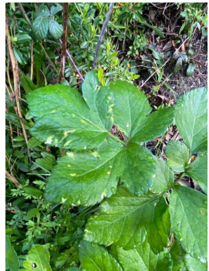
A rust fungus Puccinia smyrrii

The rust fungus is quite common and I have seen it on Alexanders plants in early January in Dorset.