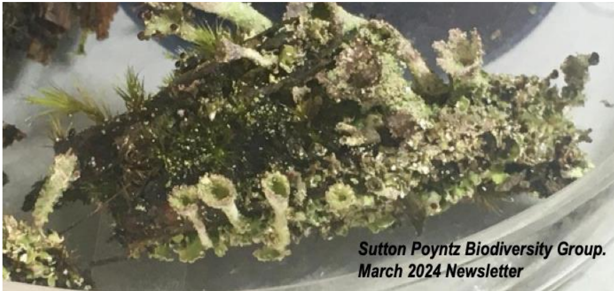
Sutton Poyntz Biodiversity Group. March 2024 Newsletter