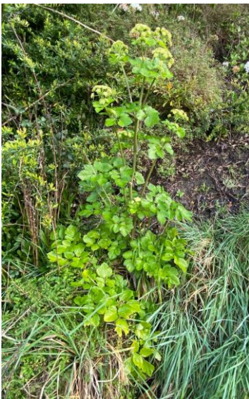
Alexanders – Preston

Whilst out walking down Preston Road, a grassy bank has some Alexanders Smyrniolum olusarum . The plant is a member of the carrot family and was introduced by the Romans. It remained popular until the 16 th century when it was replaced by celery. It is mainly a coastal plant, but does not tolerate salt, with the warmer coastal climate suiting it.