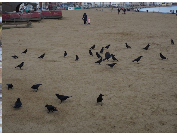
Carrion crows on Weymouth beach.

From garden bird watch, only one song thrush seen, blackbirds seen in 11 gardens but generally a good number walking round the village and Preston. Redwings generally very low numbers due to the mild weather. I get the impression that house sparrow numbers have dropped with lower than usual numbers even at Fox Cottage. Half the reports contained long-tailed tits and at least eight reports of starlings. Green woodpecker is becoming vocal again and interestingly the only bird everybody reported was wood pigeon. Attached is a summary of the years results.