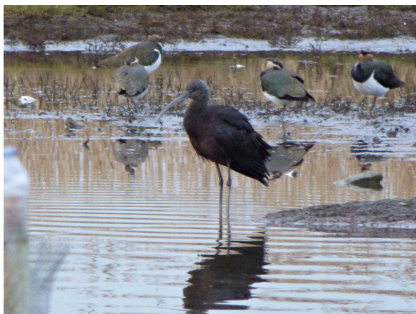
Glossy Ibis Lodmoor last week

The star of the month comes from Jon and Sue Campbell, who witnessed a glossy ibis at Lodmoor and the disgrace of the month is crows clearing up after a beach party last weekend.