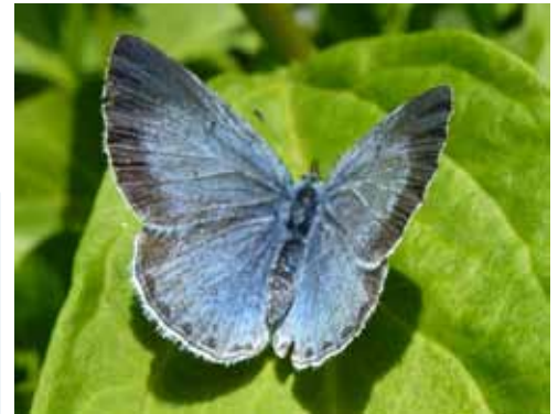
Holly Blue