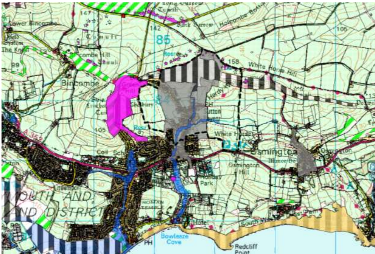
Figure 3.1: Environmental designations within the Sutton Poyntz Neighbourhood Plan area

© Crown Copyright and database right (2018). Ordnance Survey Licence number 100024307. © and Database rights Environment Agency 2016. All rights reserved. Some of the information within the Flood Map is based in part on digital spatial data licensed from the Centre for Ecology and Hydrology © NERC. © Historic England 2016. © Crown Copyright. All rights reserved 2016