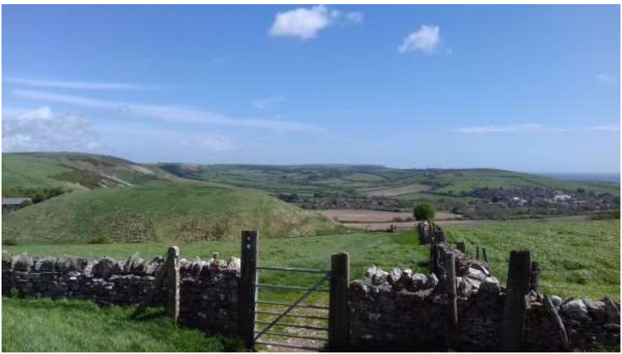
View towards Sutton Poyntz from Bincombe Bumps