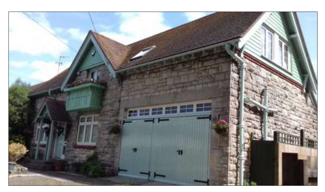
Kim Sankey RIBA, Architect & Historic Buildings Consultant

26. The Coach House was built as a service wing to the Springhead, of the same materials and style albeit more diminutive, originally providing ancillary accommodation for carts, horses and grooms accommodation in the hay loft above. The cart shed retains the original double doors and fan lights over, and latterly housed vehicles. It has a charming appearance with the timber boarded gables as opposed to half-timbered gables of the pub but is more domestic in character retaining the essence of its former use. Included for social and communal value and aesthetic interest by a local architect George Crickmay.